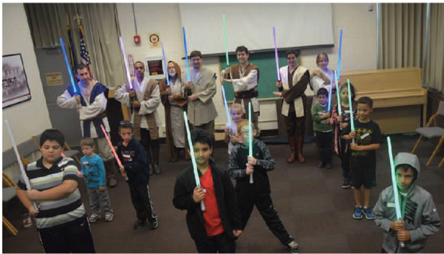
Pictured left: Participants learning light saber combat skills on Star Wars READS Day in October.