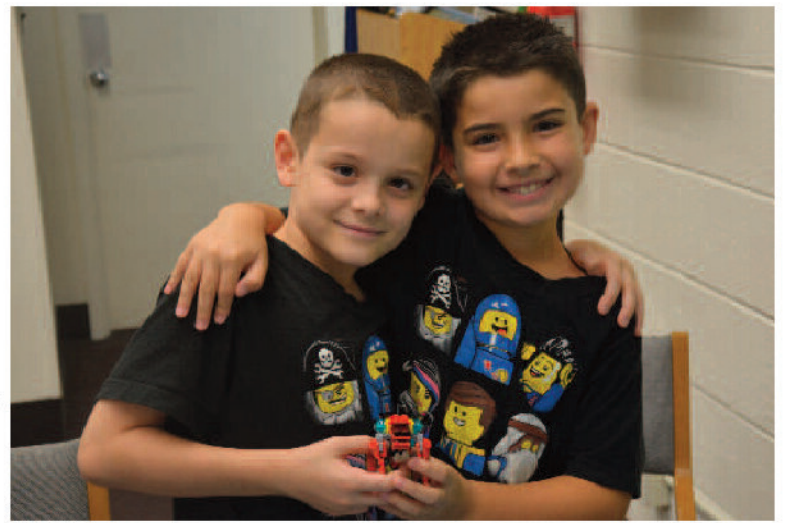
At right: We had an awesome time at Lego Make and Take!