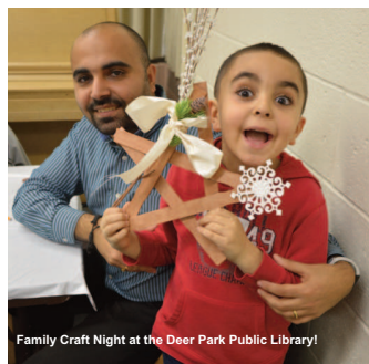
Family Craft Night at the Deer Park Public Library!