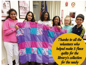
Thanks to all the volunteers who helped make 5 fleece quilts for the library's collection for the needy