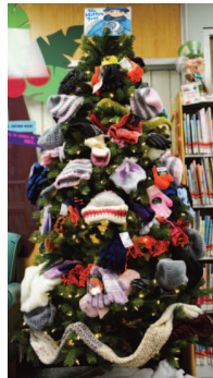
At right is "The Mitten Tree" generously filled with items donated by our patrons for those in need.