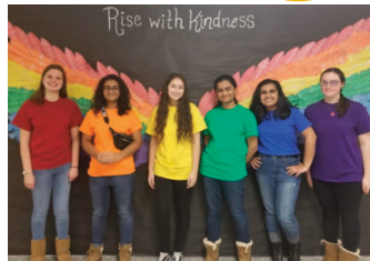
Pictured above is the Deer Park Library's team, "Color Me Captivated," that participated in the county wide Advanced Battle of the Books Competition on November 30th.