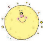
Photo Frame Fun (dpj019) 4 years – entering K Tuesday, August 6; 3:30-4:30pm Space themed storytime fun featuring books, activities, and a photo frame craft. (Separation Program- Parents are expected to remain in the building for the duration of the program.)

Kinetic Moon Sand (dpj238) Entering grades 1-3 Wednesday, August 7; 3:30-4:30pm Learn how to make a super smooth, squishy and ultra-sparkly recipe from the Moon!