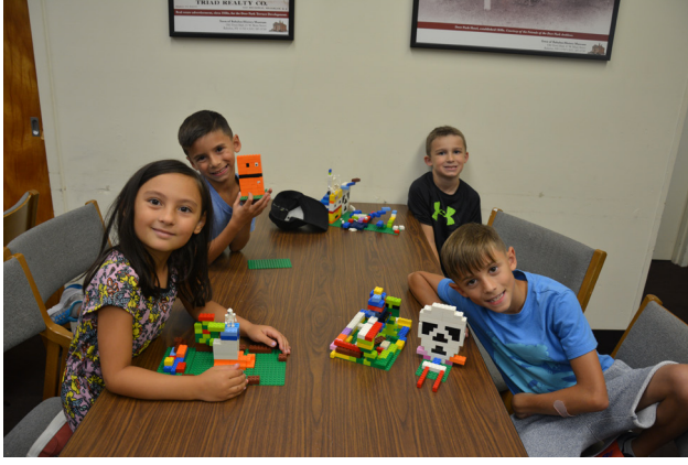
Lego Creations: Fall Fun