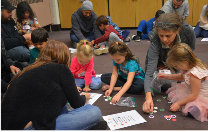
Hello Friends: Ciao Amici