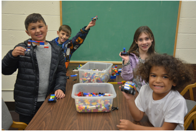
Lego Racers: First we built, then we raced!