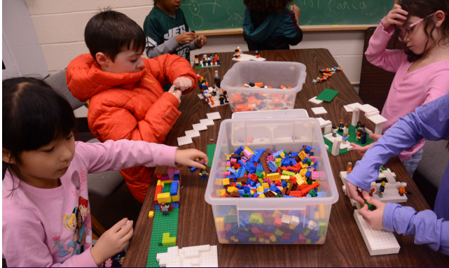
LEGO CREATIONS: WINTER WONDERLAND